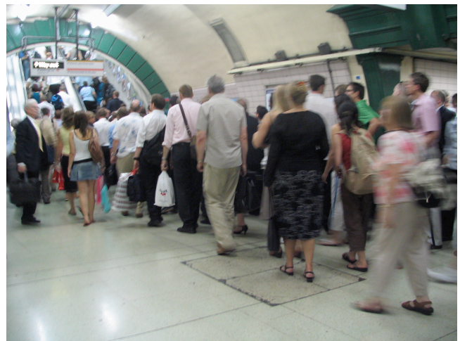
Figure 5: The flow of people underground

Building on this, we note how often that the focus of people's attention in transit is the transit of other people. Though we might think of the flows of public transit in terms of trains, busses, and their routes, what really flows here are people (see Figure 5), engaged in complex journeys that employ multiple forms of travel and that intersect in rich and complicated ways. Again drawing inspiration from the notion of relational aesthetics, we can recognize in the data a concern with the ways in which ones positionality with respect to these flows and with respect to the particular others who exemplify them is an aesthetic consideration. It is part of the experiential fabric of urban travel. This suggests that there is some scope to think about journeys rather than routes, to think about journeys as iterated and intersecting, and to think about the link between people and larger collectives, all as sites for design engagement and intervention.