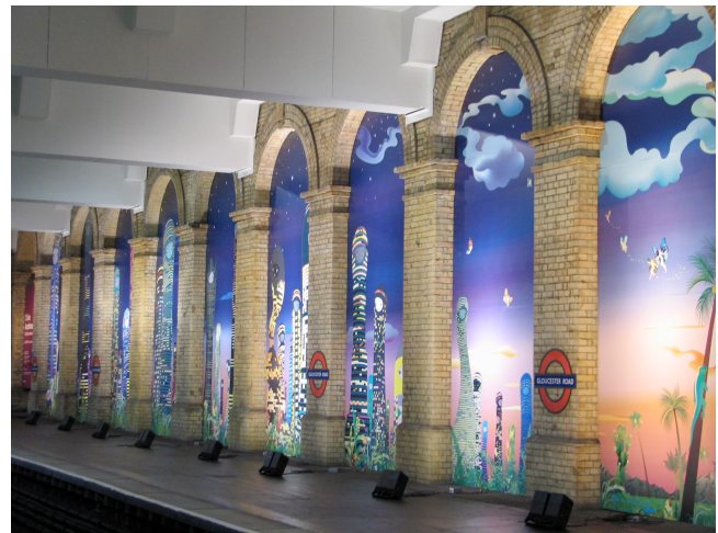
Figure 1: City Glow, Mountain Whisper by Chiho Aoshima

The name Platform for Art is taken from the Transport for London’s program of the same name. This program is one in which artists have the chance to display their works within the Underground. In Figure 1 you can see one of the main pieces from the summer of 2006, a massive mural installed at the Gloucester Road station. Beyond explicitly curated works of art, the Underground also has a long history of architectural design. Great care was put into the design of stations, with distinct looks emerging for each different time period during which they were built. Even the Tube map itself is famous for its design. But for us the idea of Platform for Art does not end with the top-down decision of the London Underground to support artistry within its tunnels. In fact it only begins there.