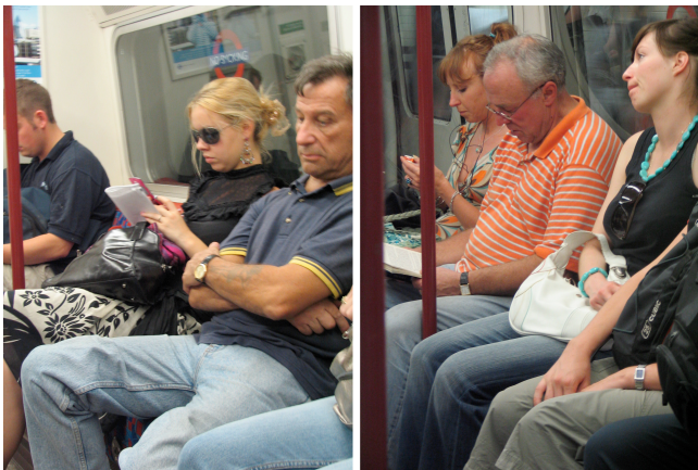
Figure 2: Personal aesthetics in the Underground

fashion is unique to the Tube, but rather that these cues play an important role in this tightly packed space, and they work in concert to actively create to the visual landscape of the Underground. On the right of Figure 2 you can see a photo of three people, strangers, who have managed to sit in a color-coordinated fashion. The bold orange and turquoise highlighted with flecks of white is truly striking. That is of course not to say that the effect was planned by these passengers, but rather that the Tube is a place where these sorts of serendipitous alignments can, and do, happen.