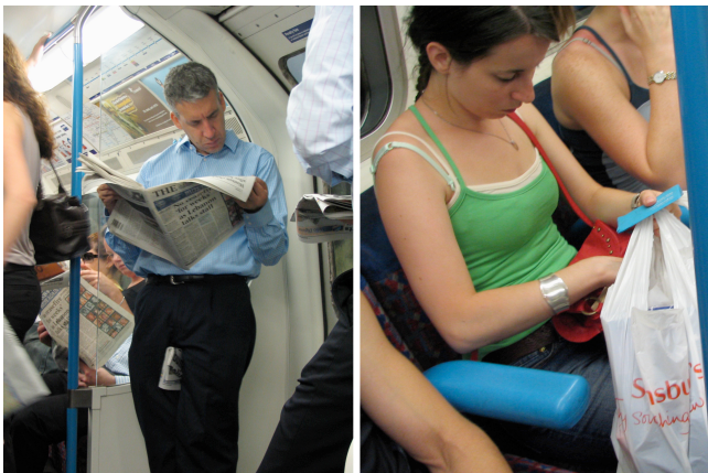
Figure 3: Passengers keeping their hands full

When riding the Tube one of the first things one notices is the multitude of objects passengers are engaged with simultaneously. On the left of Figure 3 we see a man reading one newspaper while holding another between his legs, and on the right we see a woman rummaging through her purse with one hand while clutching two grocery bags and her Oyster Card (the RFID-based train ticket used in the Underground) in the other. These types of activity are the norm in the Tube—passengers seemed to have their hands constantly engaged in a sort of ongoing juggling act. Even when people carried music players they busied their hands with the player itself, a newspaper, a book, or any another object available.